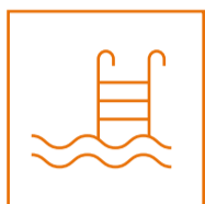
Swimming pool wet areas

Zip Clip corrosive resistant non-metallic rods are designed to safely support services into corrosive or sensitive environments such as: